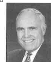
From the President