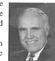
From the President

Are you a life member of the Alumni Association? Check the code above your name on the address portion of this letter. If the last digit is a 0, you are not a Life Member. You can correct