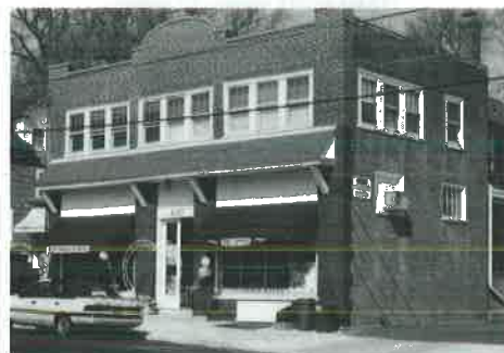
This building on Mount Carmel Avenue once housed Schuenemann's Pharmacy.