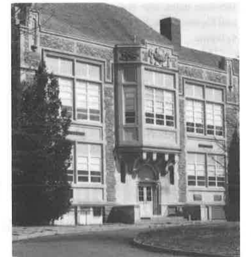
The former Huntington Junior High School.

The center's community room in the original Abington school building is envisioned as the first link in an electronic village in Abington Township. The developers plan to donate a room to Abington Township, and Penn State University will donate six computers. Penn State students will train inter-