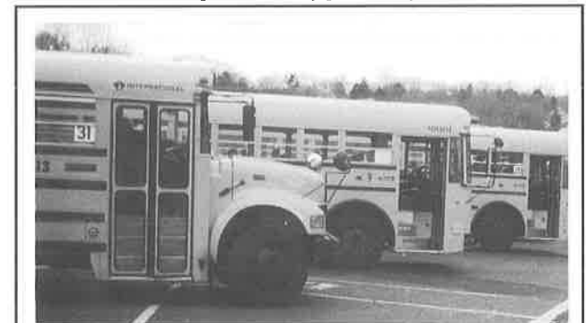
When was the last time you rode a school bus?